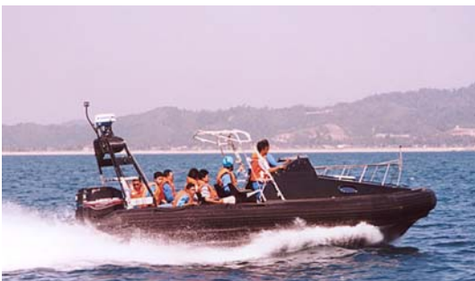
MSET INFLATABLE COMPOSITE CORPORATION SDN BHD