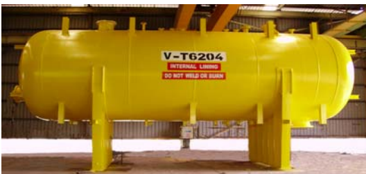
MSET ENGINEERING CORPORATION SDN BHD