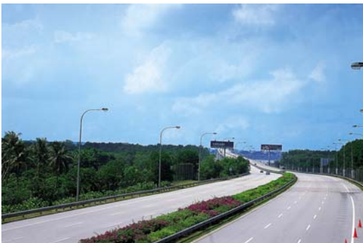
MSET DEVELOPMENT CORPORATION SDN BHD