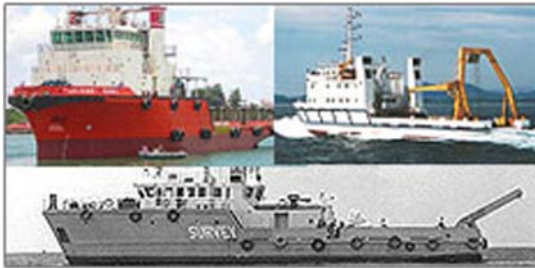
MSET SHIPBUILDING CORPORATION SDN BHD